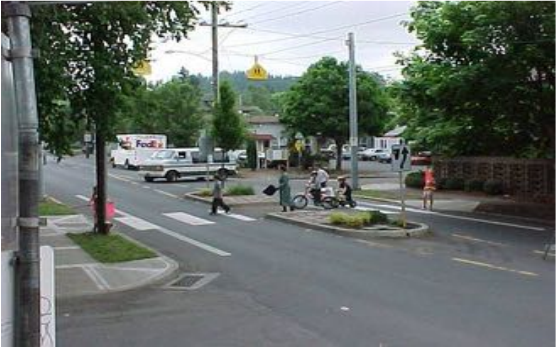
Crosswalks and median islands